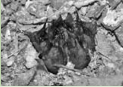
Rhizanthella slateri – eastern Australian underground orchid

Already 15 visits have been made to the site to gather data on the life cycle and ecology of each species and to collect samples for research. Further fieldwork will involve translocating some individuals identified within the road footprint, and the identification and assessment of other sites suitable for translocation or re-introduction of laboratory propagated orchids.