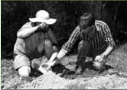
Soil sensors have been installed at the Australian National Botanic Gardens to accurately determine the water needs of the living collection

The Australian National Botanic Gardens (ANBG) is taking action nationally, regionally and locally in response to the challenges of climate change. This includes: