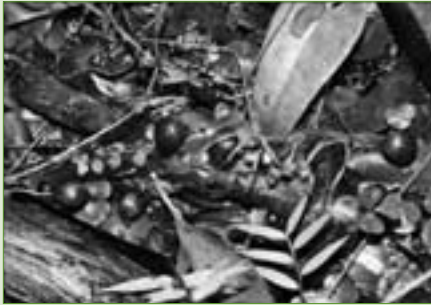
Corybas dowlingii , one of the three orchids that are the subject of the Bulahdelah Orchid Recovery Project

In partnership with the NSW Roads and Traffic Authority, the Centre for Plant Biodiversity Research is investigating the biology of three threatened species of orchid, which are affected by the proposed Pacific Highway Upgrade at Bulahdelah in NSW.